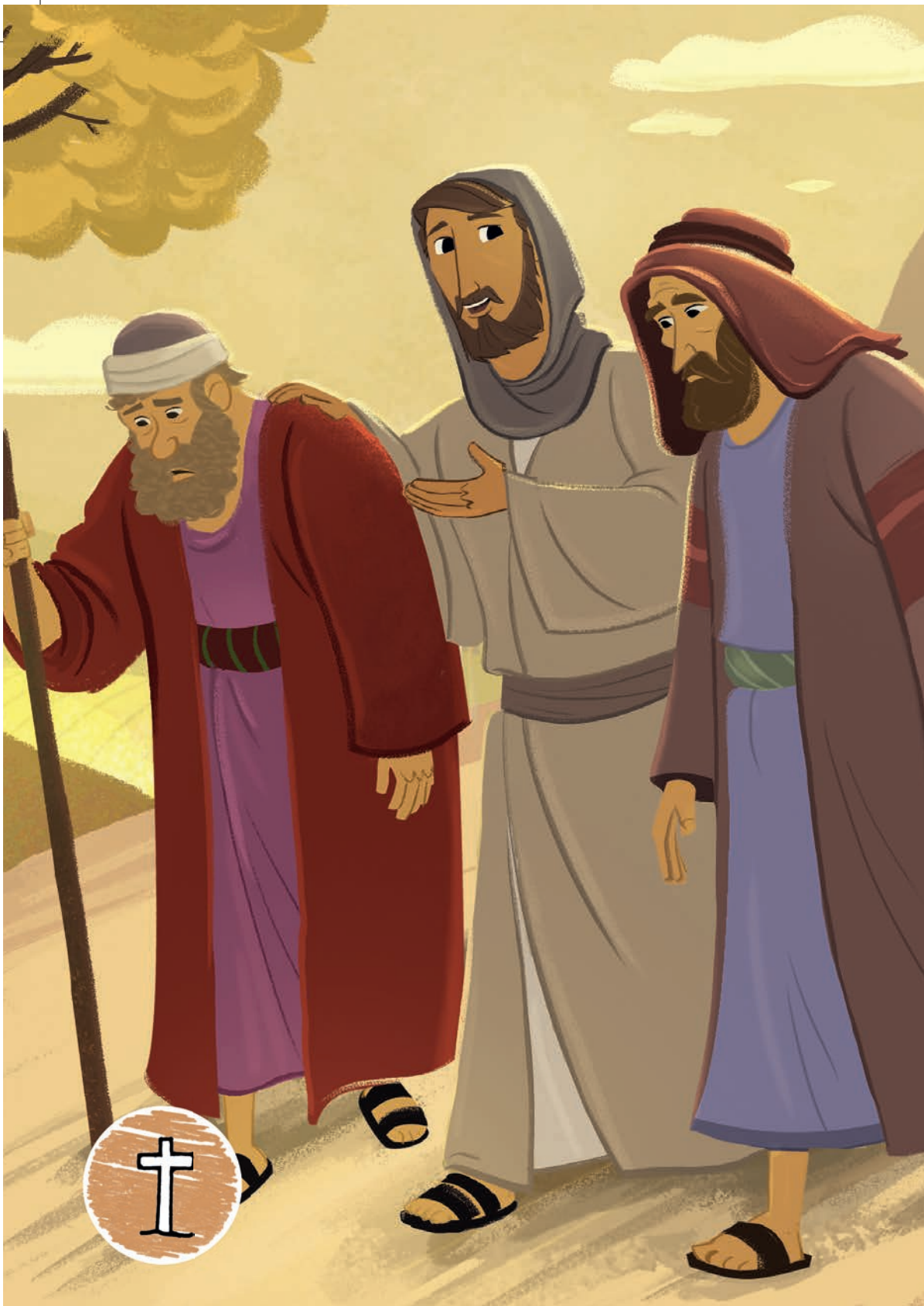
The Emmaus Disciples, Mark 16:12-13; Luke 24:13-35