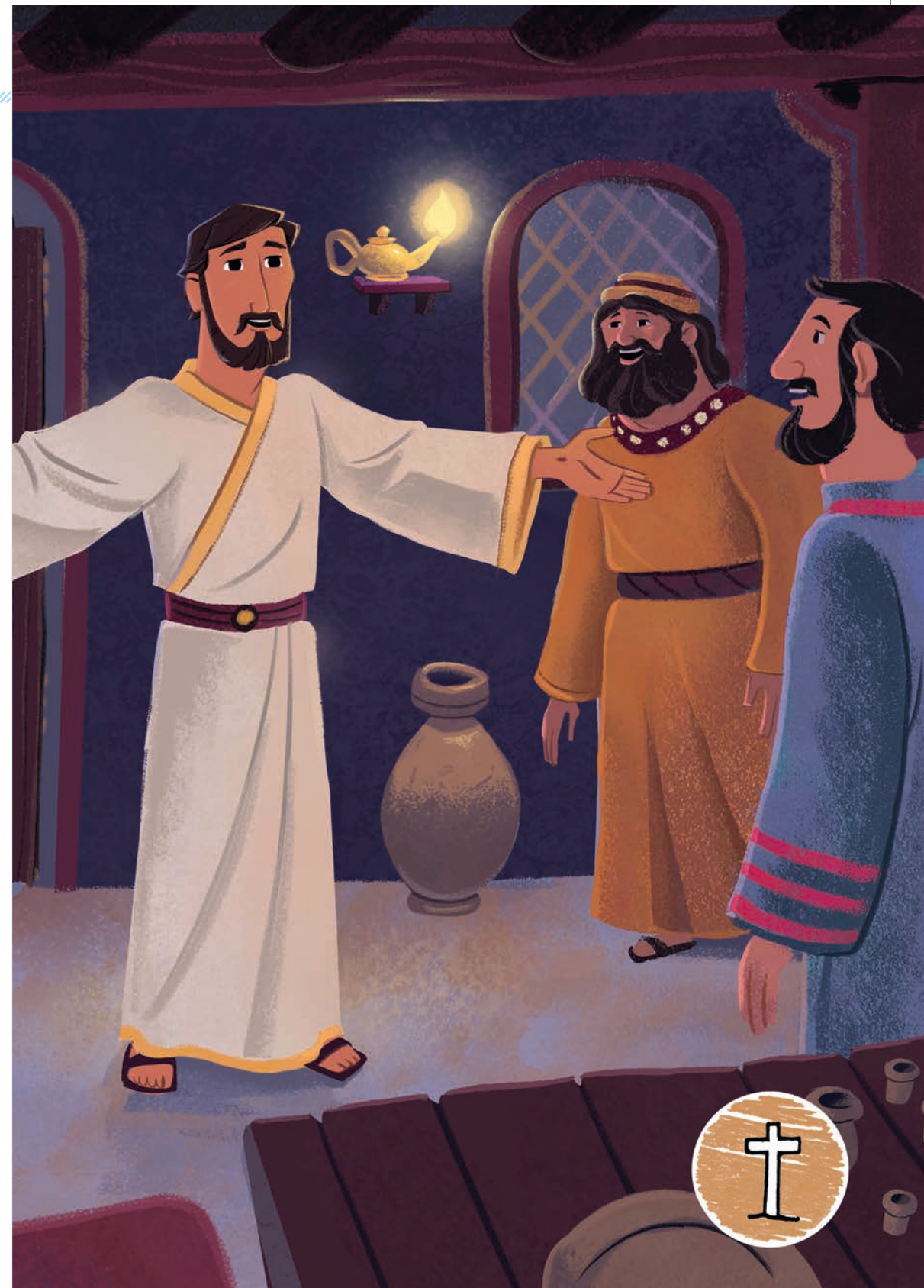
Jesus Appeared to the Disciples, Mark 16:14; Luke 24:36-43; John 20:19-29; Acts 1:3

But the disciple Thomas had not been with them that day. When the other disciples tried to tell him that Jesus had risen, Thomas said he must see Jesus with his own eyes before he could believe. Jesus did appear to His disciples again, and this time Thomas was with them. Seeing Jesus, he did believe. But Jesus said those who believe without seeing are blessed.