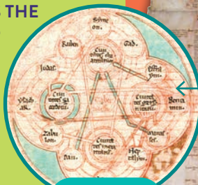
DIAGRAM OF THE 12 TRIBES OF ISRAEL

The TIMELINE in this photograph was created in the year 1230 by Peter of Poitiers. Like Matthew, Peter of Poitiers went back many, many generations to record Jesus's family tree and create this timeline of world history.