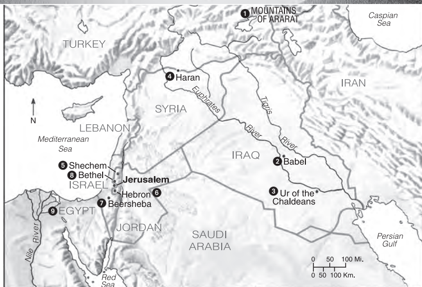
Modern names and boundaries are shown in gray.

KEY PLACES God created the universe and the earth. Then he made man and woman, giving them a home in a beautiful garden. Unfortunately, Adam and Eve disobeyed God and were expelled from the garden (3:24).