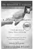
A Touch from Heaven 9780768403275