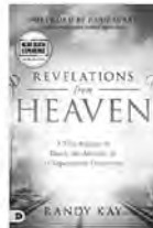
Revelations from Heaven 9780768459371