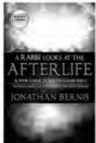
A Rabbi Looks at the Afterlife 9780768404104