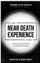
Real Near Death Experience Stories 9780768464054