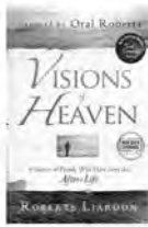
Visions of Heaven 9780768402971