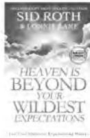
Heaven is Beyond Your Wildest Expectations 9780768402865