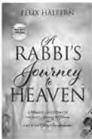
A Rabbi's Journey to Heaven 9780768461442