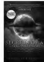
Secrets from the Supernatural World 9780768437010