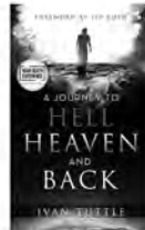
A Journey to Hell, Heaven and Back 9780768458350