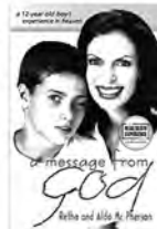
A Message from God 9780768464320