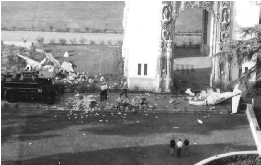
Valhalla Memorial Cemetery Portal of the Folded Wings Shrine to Aviation (crash site)

The twin-engine Piper Navajo struck the mausoleum five feet from the top of its brightly tiled dome. The report from the NTSB said we collided at an official impact speed of 135 miles per hour. On impact, our airplane shattered into thousands of pieces, sending all three of us slamming head-on into the solid building. We were then catapulted into a free fall, resulting in a bone-crushing impact with the ground seven stories below.