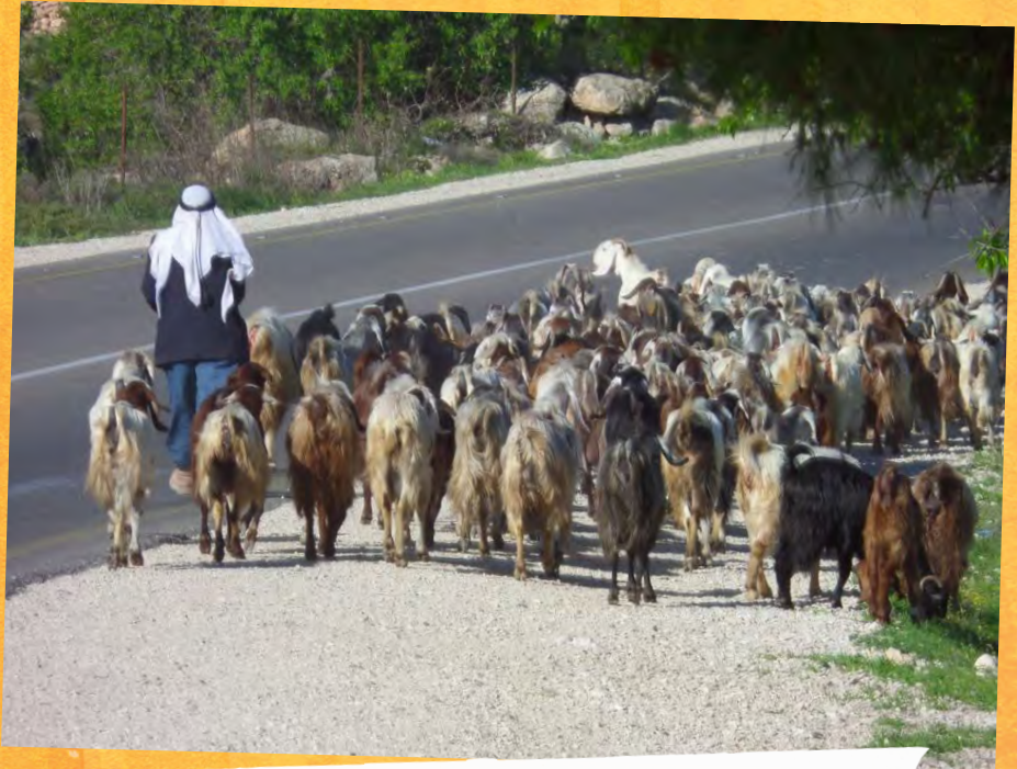
SHEPHERD WITH FLOCK IN ISRAEL