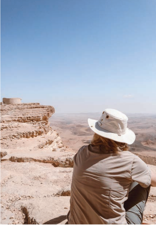
Looking out from Maktesh Ramon in the Wilderness of Paran