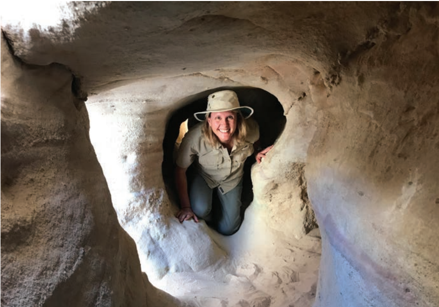
In the copper mines at Timna Park in the southern wilderness of modern Israel

It's something I call the "Middle Eastern lens." For Westerners, taking off our Western cultural lens and putting on a Middle Eastern lens adds greatly to our understanding of what the biblical authors and characters—Middle Easterners living in a Middle Eastern cultural framework—meant by what they said and did. In the words of author, professor, and New Testament scholar