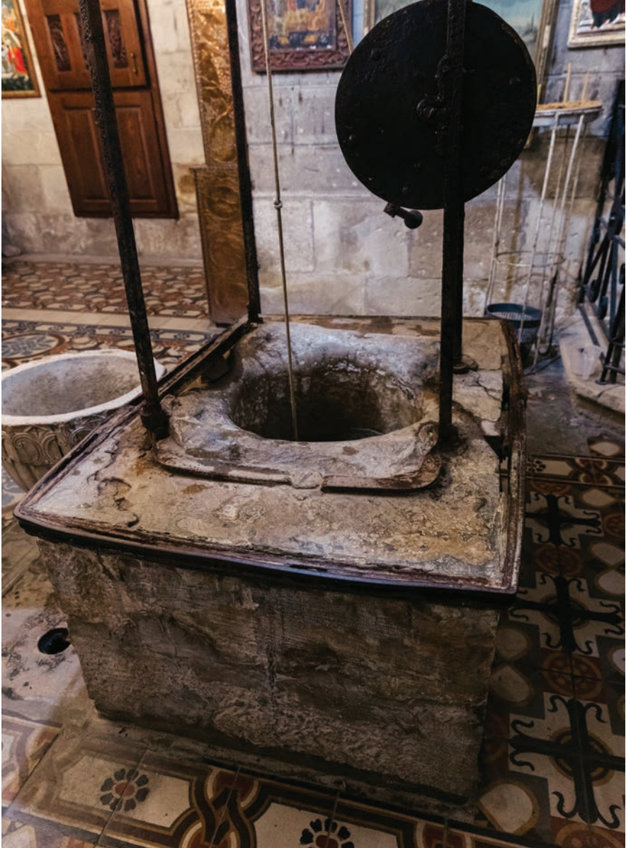
Jacob's Well near the ancient city of Shechem (modern-day Nablus)

Genesis. Jacob's Well is very deep and has never run dry. The Bible is not only the best Story that has ever been written, but also the truest. These things happened!