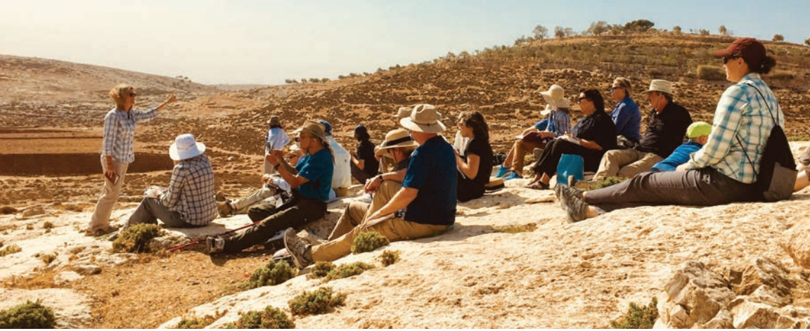
Teaching at a sheepfold