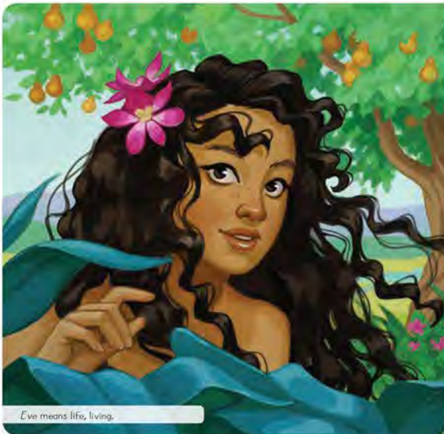
Eve means life, living.

19 Now the LORD God had formed out of the ground all the wild animals and all the birds in the sky. He brought them to the man to see what he would name them; and whatever the man called each living creature, that was its name. 20 So the man gave names to all the livestock, the birds in the sky and all the wild animals.